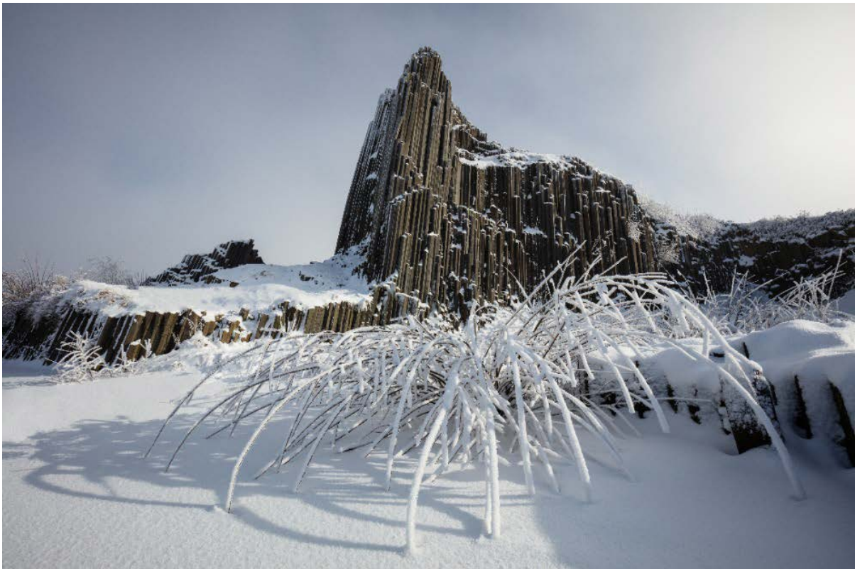
Panská rock, Lusitanian Mountains