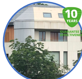
7 years after FN NANO® application