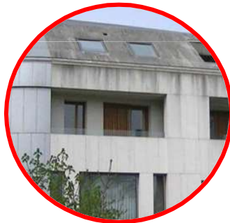
6 years after construction