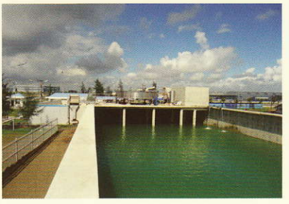
6,500 m<sup>3</sup>/day waste water treatment (ISO 9001& 14001)