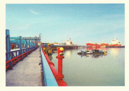
Dinh Vu Liquids Jetty 20,000 DWT