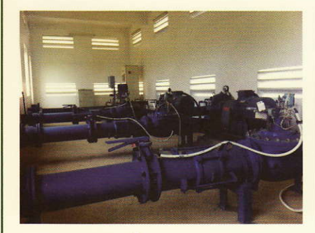
40,000 m<sup>3</sup>/day treated and raw water supply