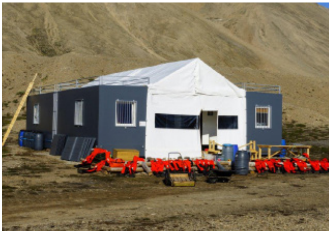
Czech field research station "Nostoc" in Petunia Bay (Svalbard)