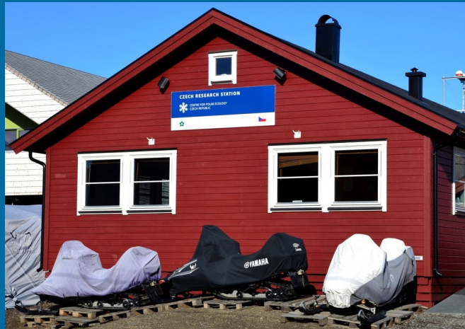
Czech research station "Julius Payer House" at Longyearbyen (Svalbard)