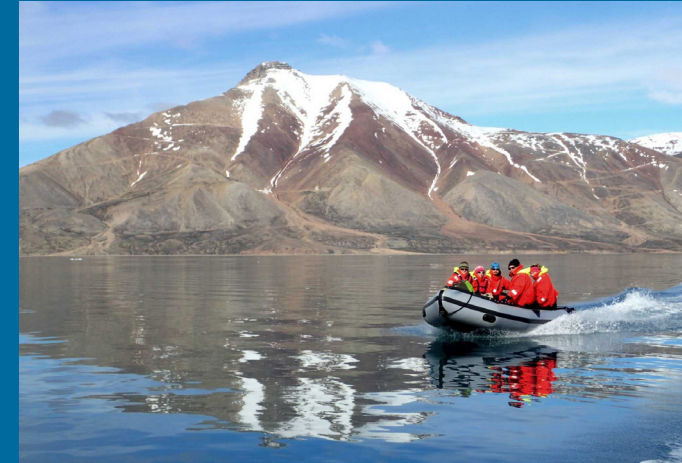
A rubber boat (zodiac) transports Czech students and scientists in Petunia Bay.