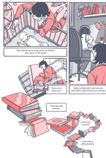
Illustration from the book: Heartcore by Štěpánka Jislová