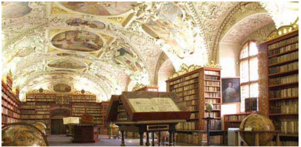
THEOLOGICAL HALL - STRAHOV MONASTERY, PRAGUE