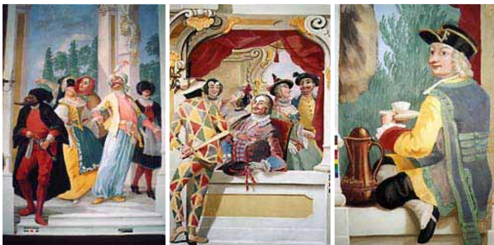
ČESKÝ KRUMLOV CASTLE MASQUERADE HALL MURALS

Brewing was an essential part of castle life! České Budějovice town received Royal permission (from Premislav II) for brewing in 1265. It has produced beer ever since – from the famous