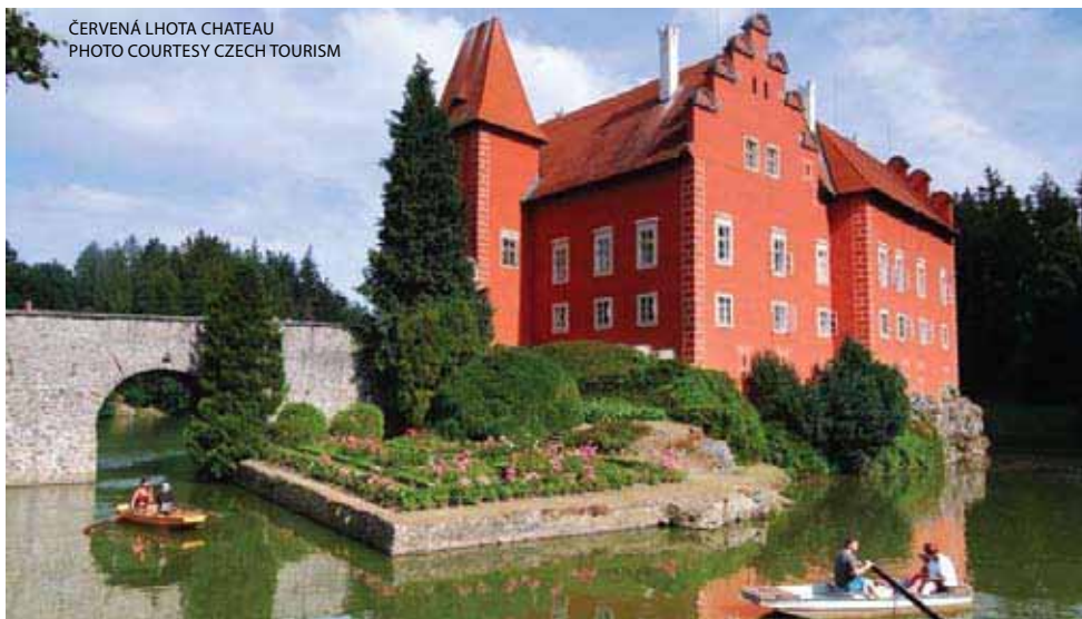
ČERVENÁ LHOTA CHATEAU

In 1583 Vilem of Rožmberk built Kratochvíle Castle . This unequalled renaissance Italian Bohemian hunting lodge is your morning's tour. Original interiors are intact, including murals. Look out (and up) for an elephant and a very early depiction of a rhinoceros – they are on the ceiling. Original settings include the dining room, the library and the chapel. There are splendid ornamental gardens and water surrounds. It was in Schwarzenberg ownerships from 1719 to 1922, and is now state owned and run. Head for your next base in Jindřichův Hradec, where you will stay right on the main square of this delightful mediaeval town. (BL)