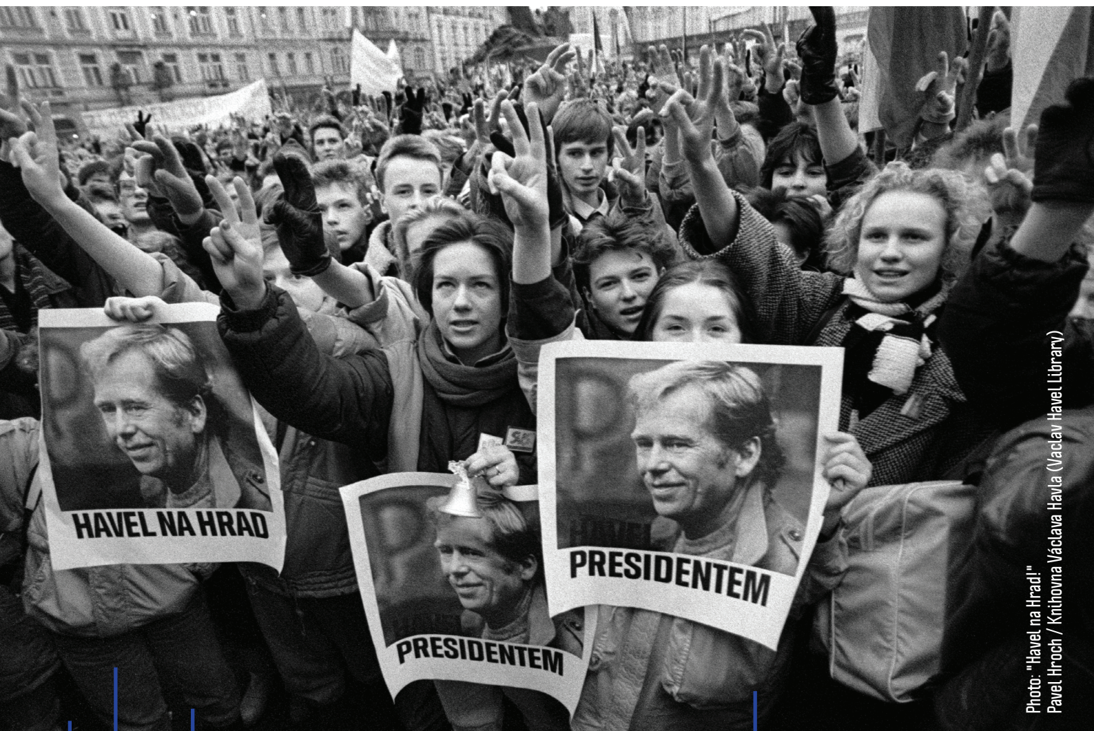
"Havel na Hrad!"

How to sustain the path towards Europe Whole and Free?