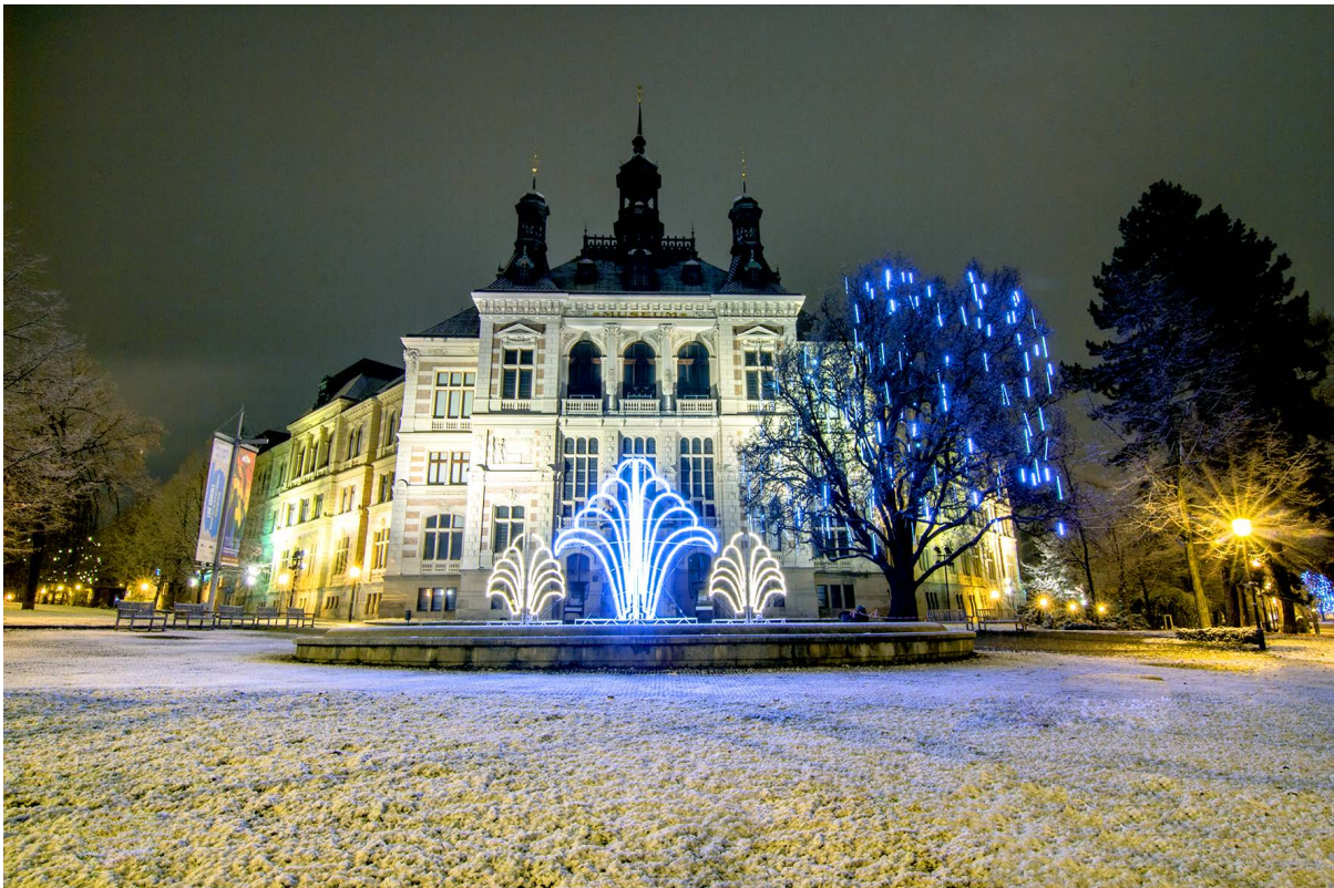
Christmas time in Pilsen