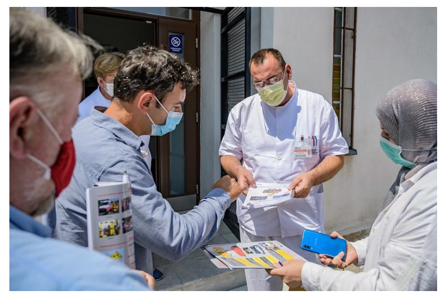
Handover of medical equipment and related materials within the project of increasing the preparedness for crises in Bosnia and Herzegovina. Implementing partner: EGO Zlín