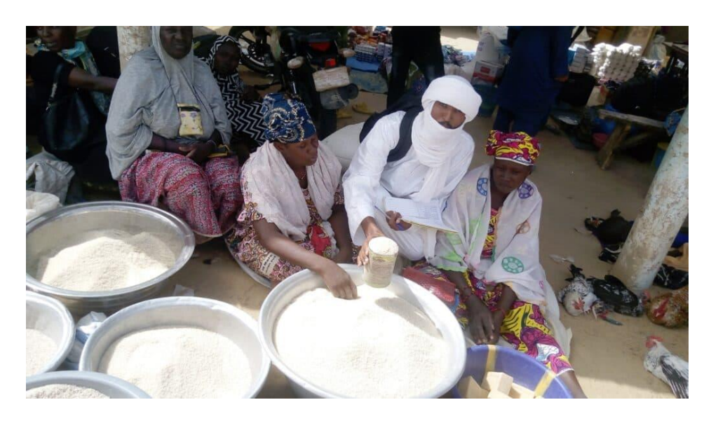
Mali – Support of livelihood and food security of internally displaced families in the region of Gourma Rharous (Implementing partner: ADRA)

Programme Africa (Programme of activities supporting source and transit countries of migration in Africa 2020-2022) was launched in 2020, with allocated resources amounting to 100M CZK. The disbursed amount of 87,7M CZK was mainly used for activities tackling medical, socio-economic and security impacts of the pandemic.