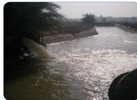
Al Hindiya Babal Barrage - discharge from the old pumping station