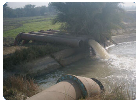
Al Hindiya Babal Barrage - old pumping station