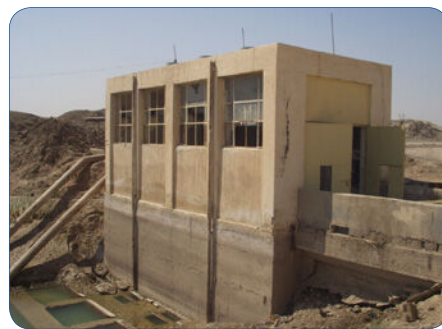
Kaiseba 2 - old building