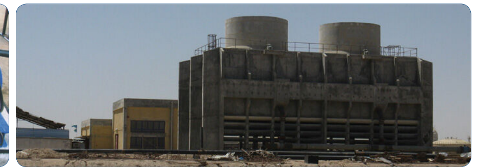
Basra Refinery - pumping station and cooling towers