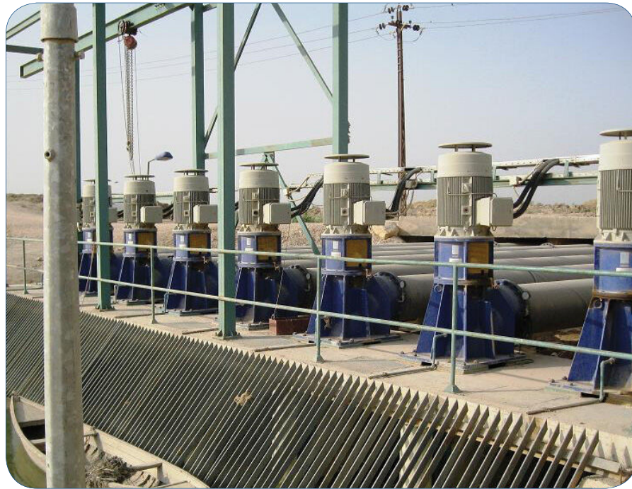
Drainage pumping station - DRAIN 22 (pump units)