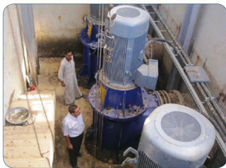
New vertical SIGMA pumps 800-AQTV