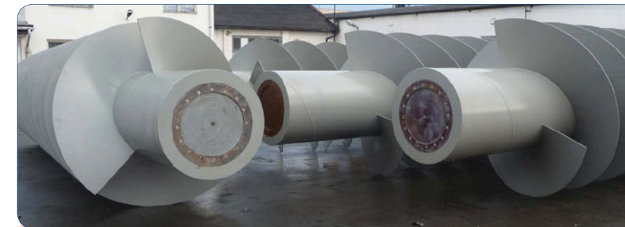
New screw pumps for PS Abu Shabka