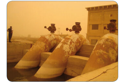
Al Shomally drainage pumping station - old building