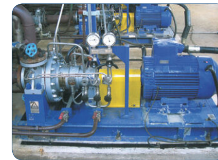
SIGMA process pump for Refinery in Baiji