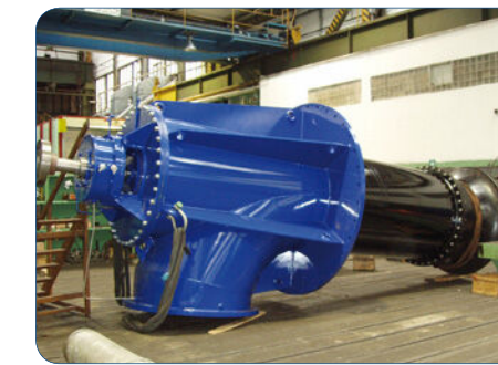
New SIGMA pumps 1400-AQSV (at works)