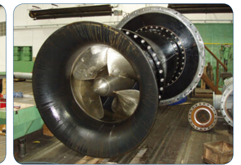
New SIGMA pumps 1400-AQSV (suction part)