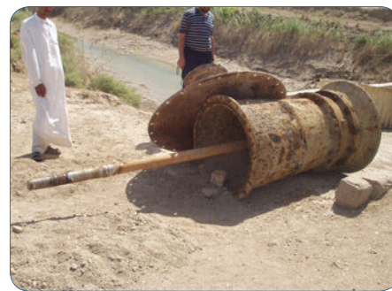
Kaiseba 2 - old pumps