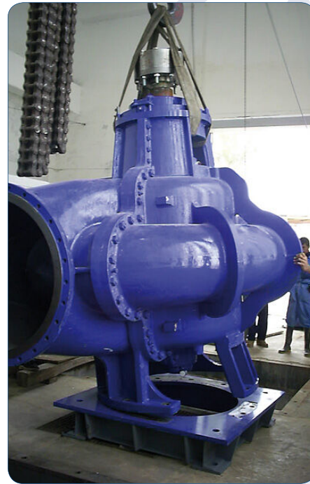
New SIGMA pump W-QN-800-LB - erection in process.