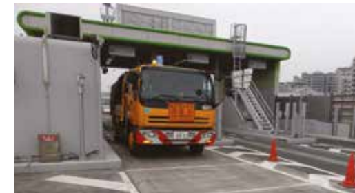
CrossWIM to Protect the Bridges Japan, Osaka