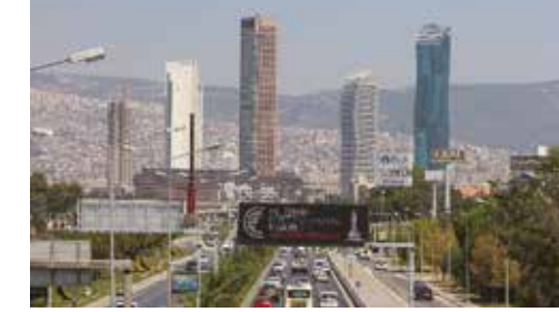
Fully Adaptive Traffic Management Turkey, Izmir