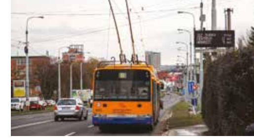
Travel Time Czech Republic, Zlín