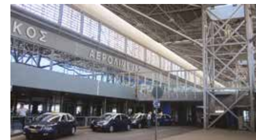
Parking System CrossPark Greece, Thessaloniki