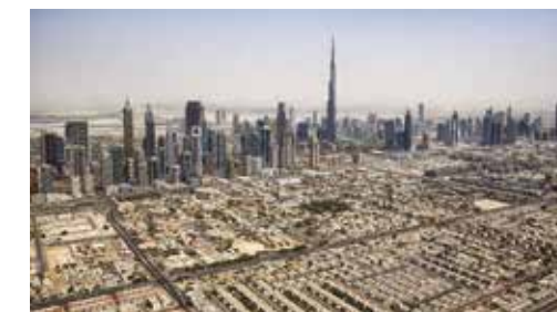
Dynamic Weigh-in-Motion CrossWIM United Arab Emirates, Dubai