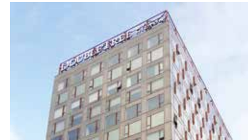
Parking System CrossPark Croatia, Zagreb