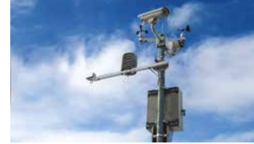
Road Weather CrossMet, METIS Czech Republic