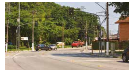
Decentralized Traffic Management Brazil, Guarujá