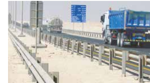
Dynamic Weigh-in-Motion CrossWIM Qatar, Doha