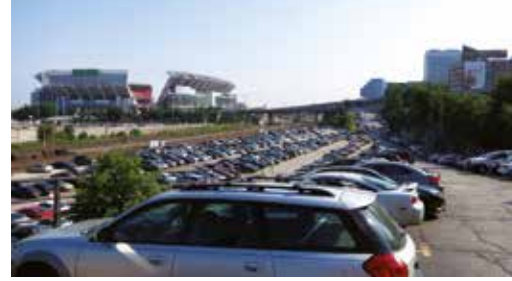
Parking System CrossPark USA, Cleveland