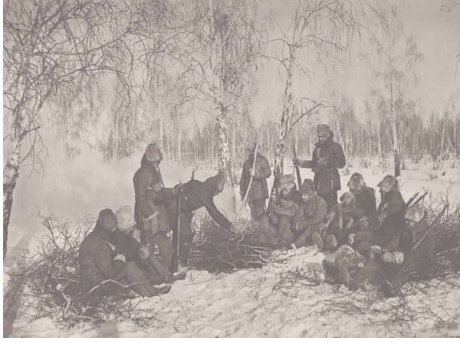
1914-1918 Czechoslovak Legions in WWI