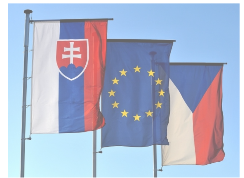
2004 Enlargement of the European Union

For more information about the project "Czech and Slovak Century", please visit www.czechandslovakcentury.com/en