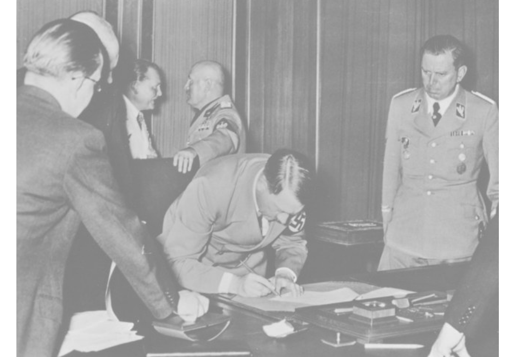
1938/1939 Munich Agreement and Occupation