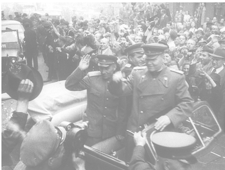
1945 WWII Liberation