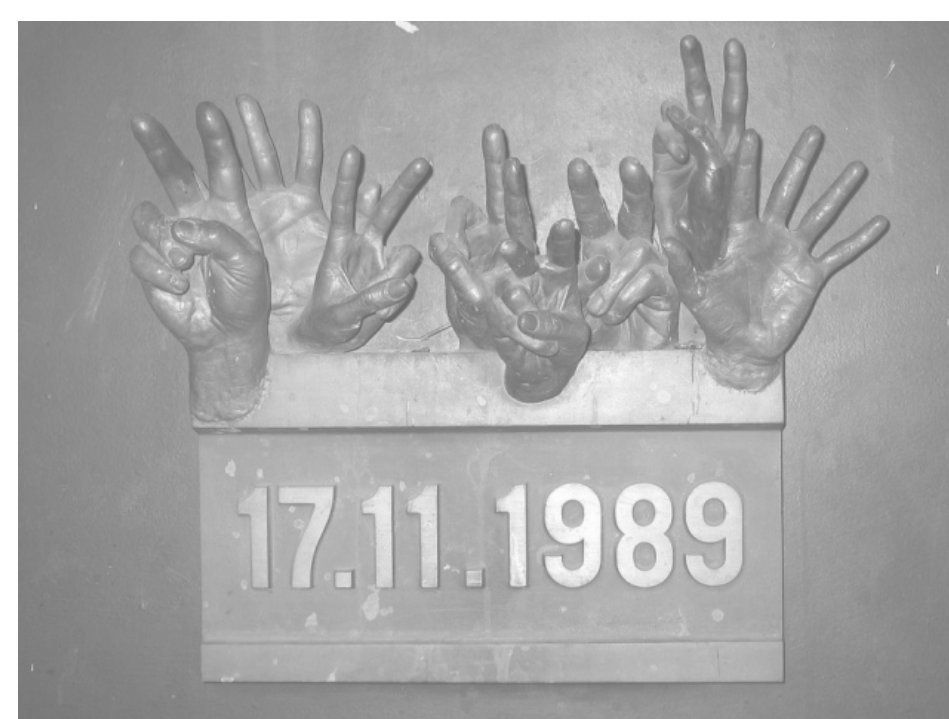
1989 Velvet Revolution