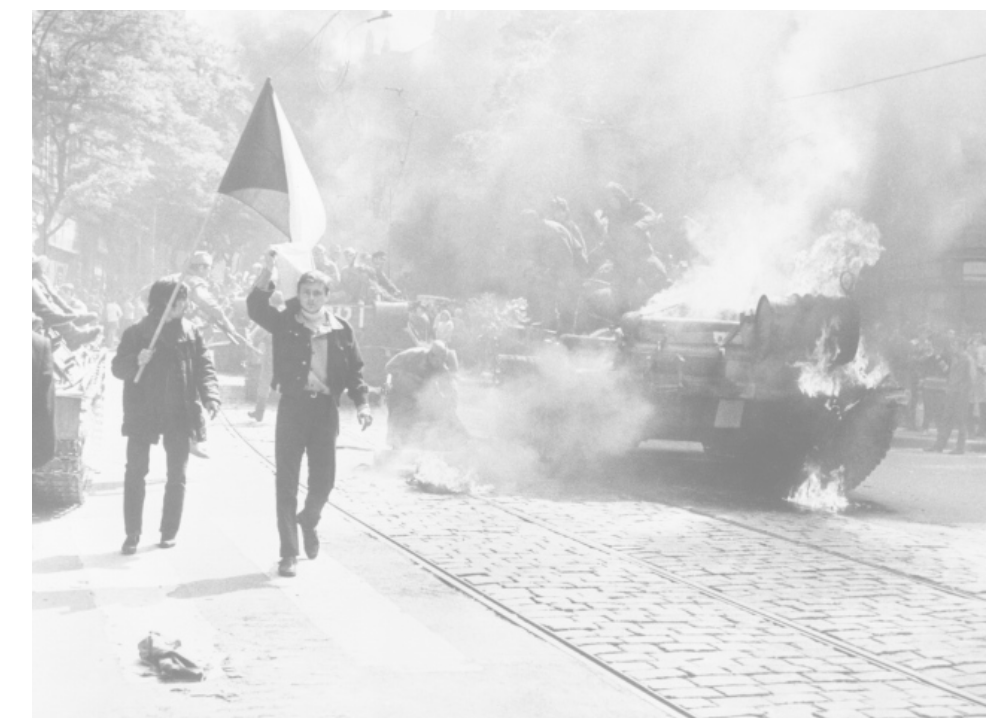
1968 Prague Spring and Occupation