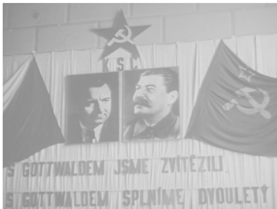
1948 Communist Coup