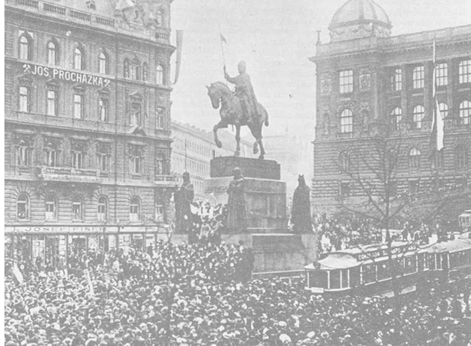
1918 Independence of Czechoslovakia