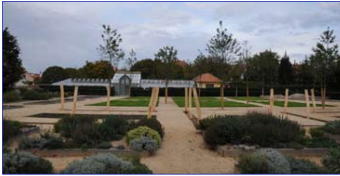
Tiree Chmelar Herb Gardens