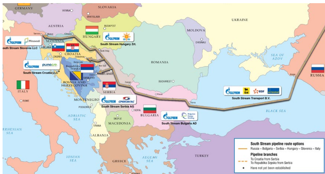
Planned route of South Stream pipeline

The projects are as follows: 'South Stream Hungary' which diversifies supply routes; the 'Hungarian-Slovakian Gas Interconnector' which is an important part of the regional 'North-South