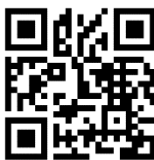
Czech Development Agency