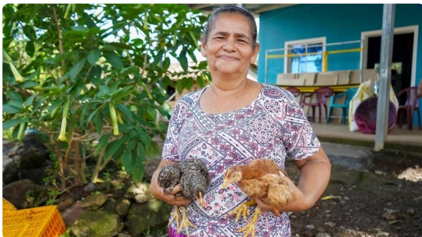
Improving food and nutrition security in the Mercedes Umaña community, El Salvador