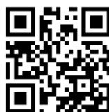
Forum for Development Cooperation