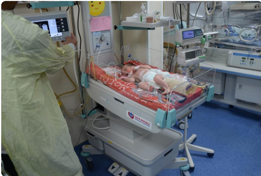
Medical equipment for the neonatal intensive care unit in Tripoli, Lebanon