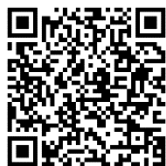
EU FDC and humanitarian aid