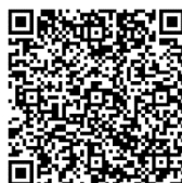
Information on FDC, humanitarian aid, TRANS and ODA