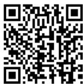
OECD Development Assistance Committee