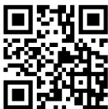
FDC and humanitarian aid on the MFA website