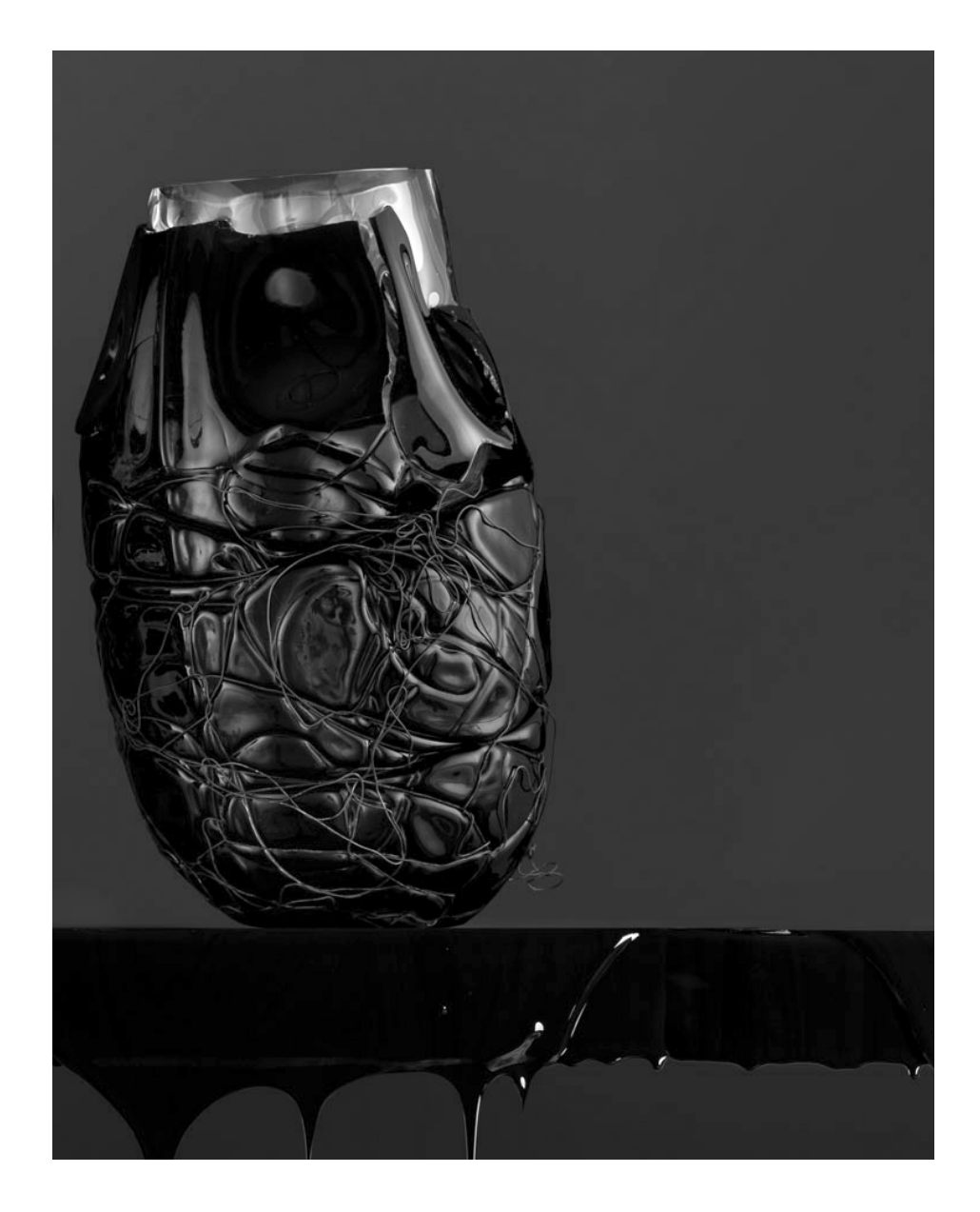
KETO vase , 2021 Crystal glass, wire, black crystal glass ø17 x H30 cm

Lollipop vase , 2023 Crystal glass, lollipops, rubber sealer ø28 x H35