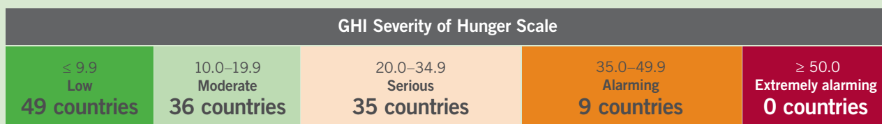
FIGURE 2 NUMBER OF COUNTRIES BY HUNGER LEVEL ACCORDING TO 2022 GHI SCORES

The GHI categorizes and ranks countries on a 100-point scale: values of less than 10.0 reflect low hunger; values from 10.0 to 19.9 reflect moderate hunger; values from 20.0 to 34.9 indicate serious hunger; values from 35.0 to 49.9 are alarming ; and values of 50.0 or more are extremely alarming (Figure 2).