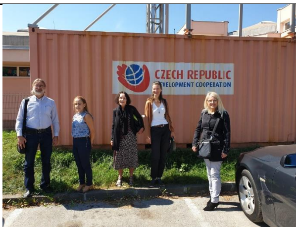
Container heating system is placed next to the main building and does not disturb neither the look nor the surrounding