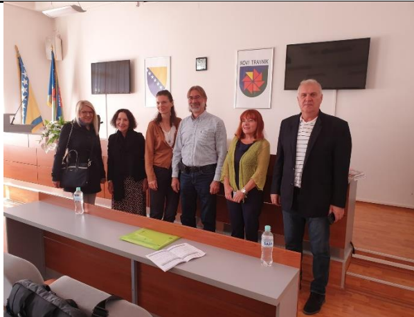
Meeting at the Municipality Novi Travnik