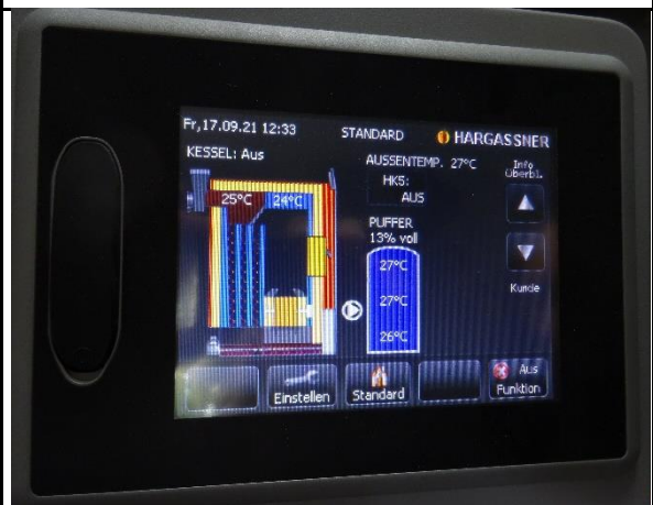
The control visualization display on the boiler provides good information about the combustion process