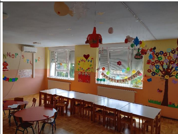
The rooms in the kindergarten in Ljubuski are colourfully decorated to make them attractive to children