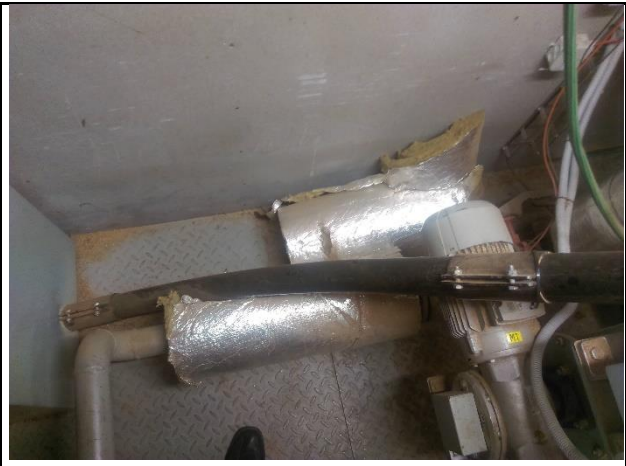
The system of feeding pellets into the boiler is out of operation, the reason may be a bent feed pipe with a rolling auger in the photo