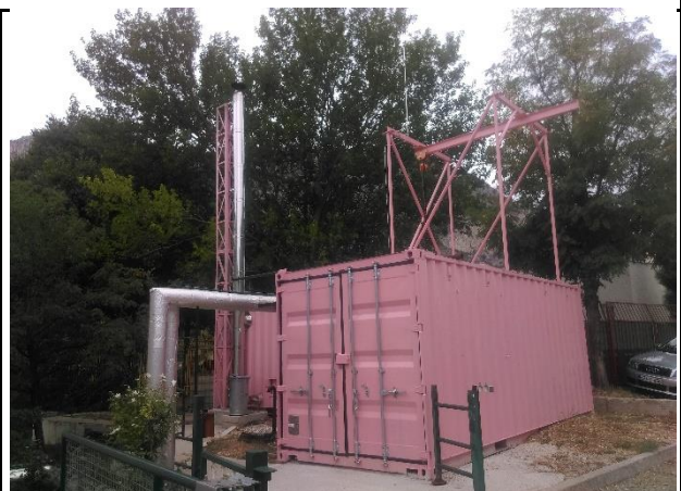
The new boiler room is located in two containers - for the boiler and for the fuel storage