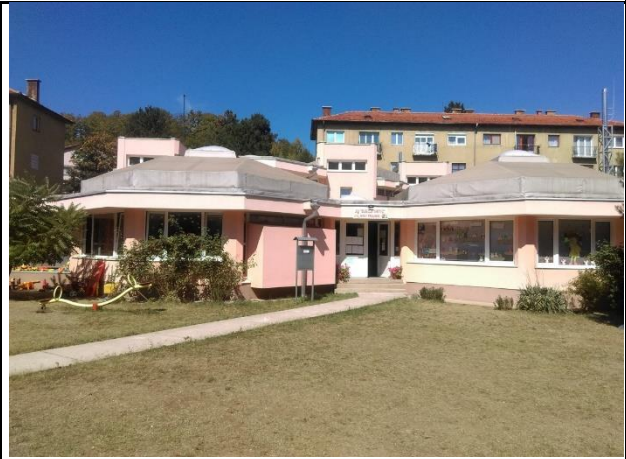
Kindergarten in Novi Travnik