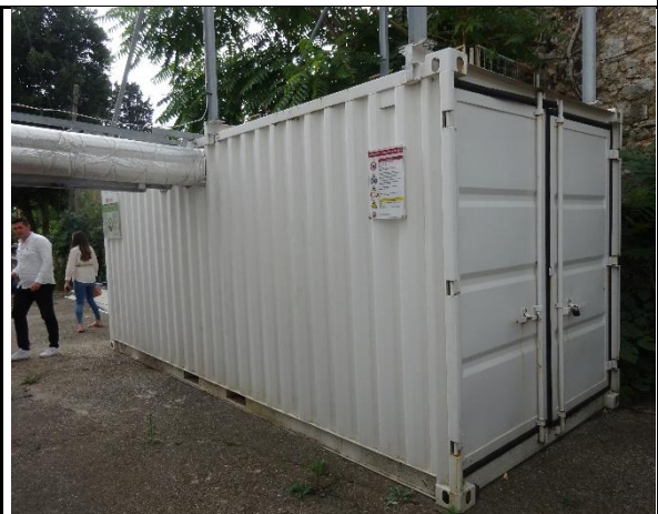
The heating is again located in a container outside the building