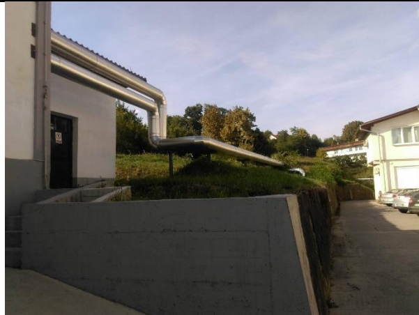
The main heat outlet from the boiler room of the Hospital of St. Lukáš to a large hospital complex