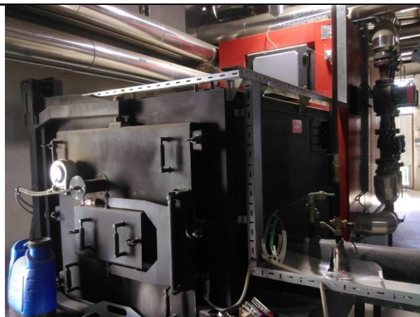
Two Topling boilers heat 12 buildings in the area of the Hospital of St. Lukas in Doboř