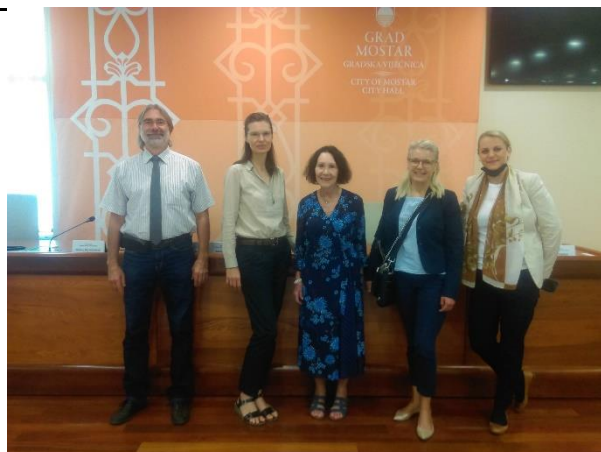
Meeting at the City of Mostar