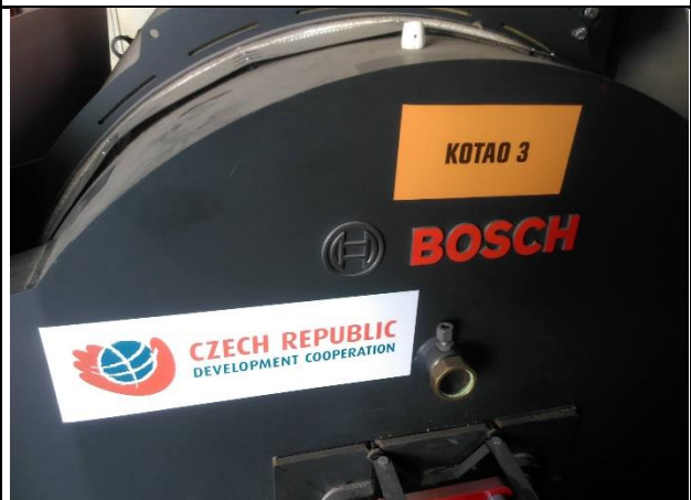
The Bosch light fuel oil boiler only acts as a reserve and has not yet been used