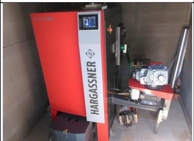
The users in Novi Travnik of the technology Hargassner expressed their high satisfaction with it