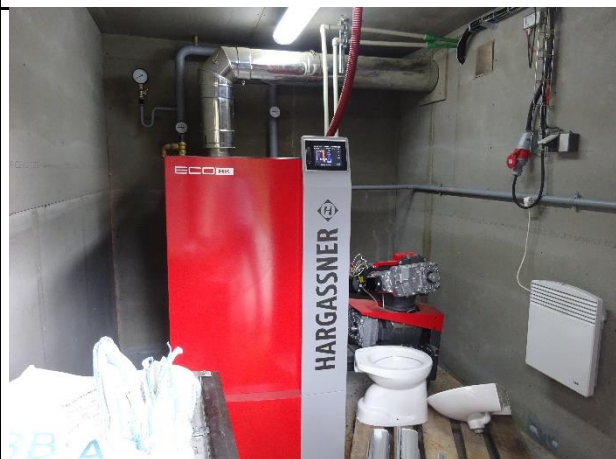
Hargassner technology was also described here as high-quality and trouble-free