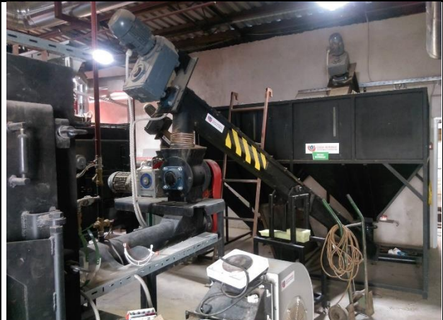
The technology of feeding fuel - pellets - to Topling boilers is robust and fully automatic