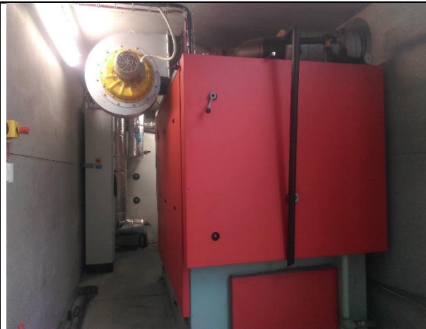
The Czech boiler Verner Golem is to heat the entire building of the House for Old and Infirm People in Mostar