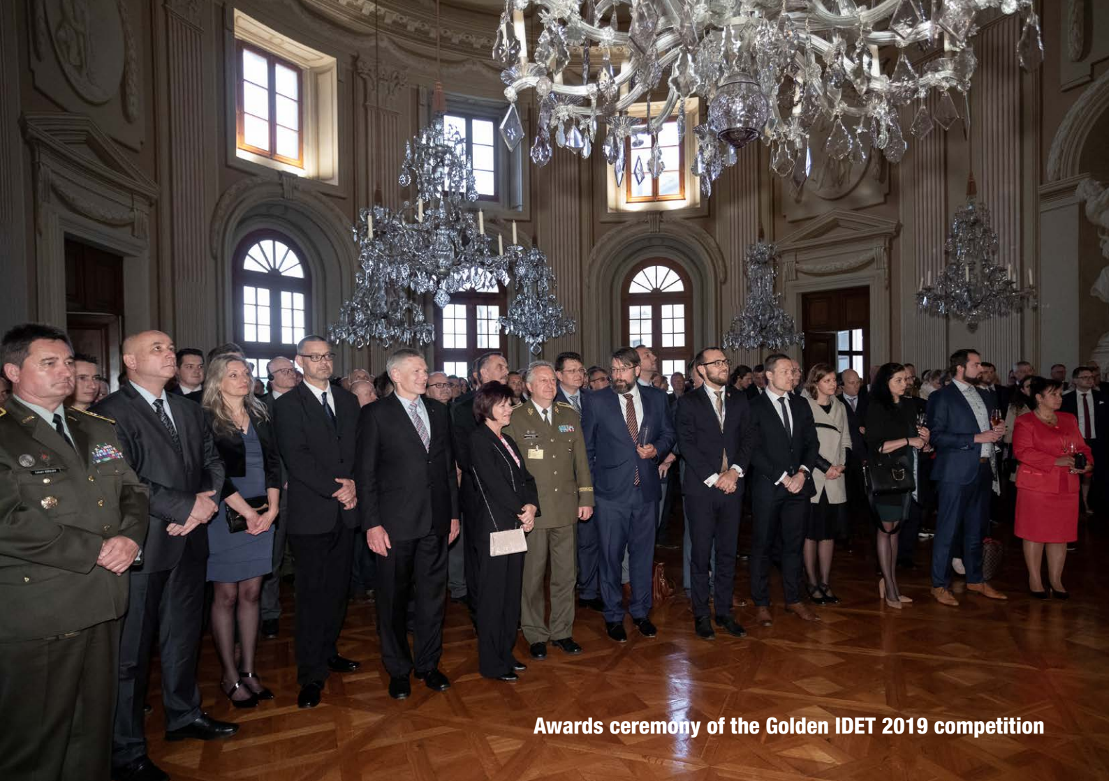
Awards ceremony of the Golden IDET 2019 competition