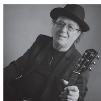
Petr Janda Singer, Songwriter & Guitarist Frontman of Olympic, #1 Czech Rock Band www.bestia.cz/olympic