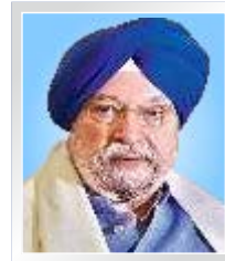
Mr. Hardeep S. Puri Honorable Minister of Civil Aviation