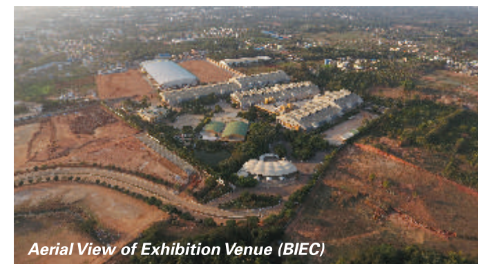
Aerial View of Exhibition Venue (BIEC)

*Service taxes will be extra, as applicable.