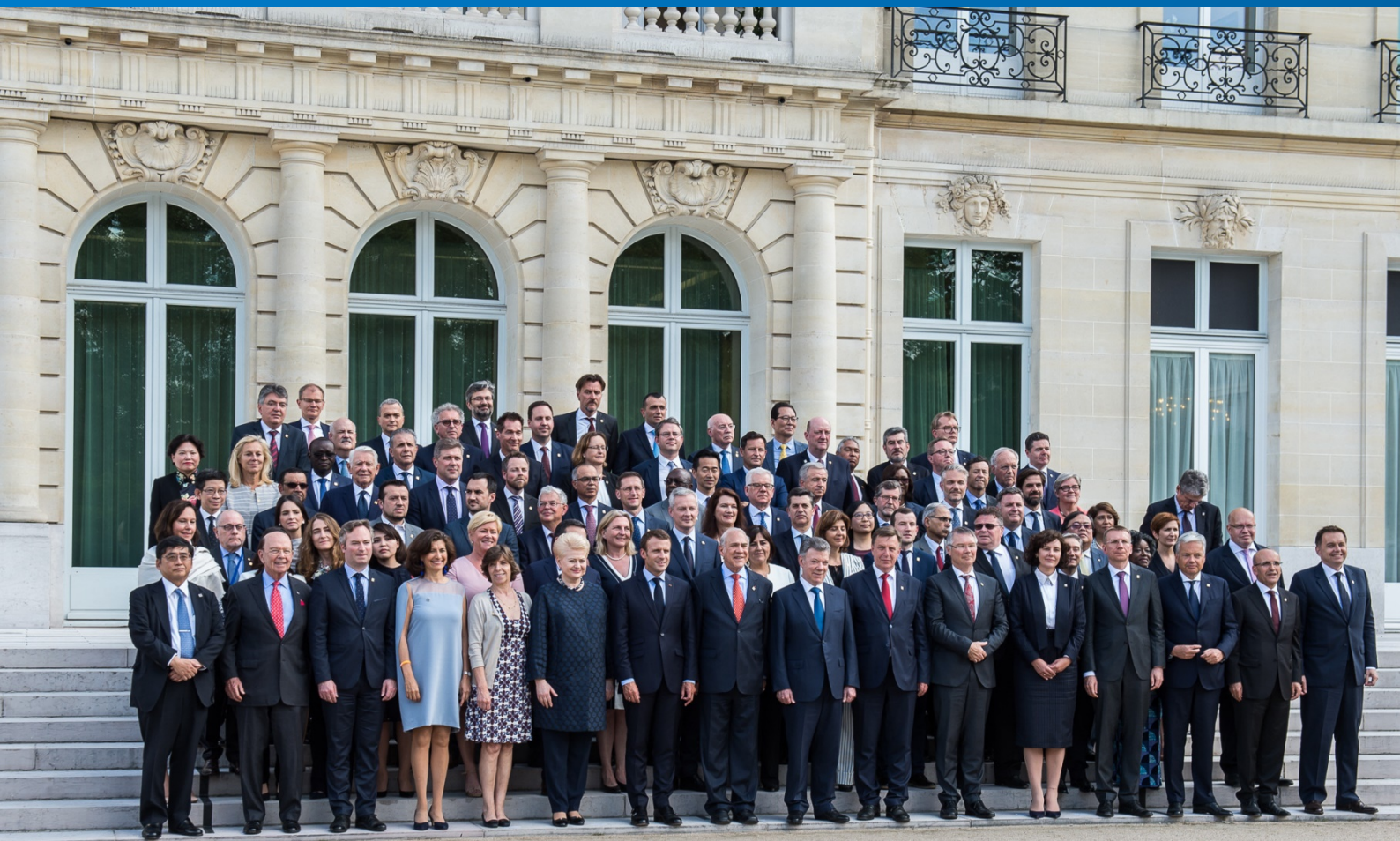
OECD Ministerial Council Meeting – Paris, May 2018