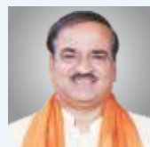
Shri Ananth Kumar Cabinet Minister for Chemicals and Fertilizers, Government of India

“The 3 major issues that India Chem focuses in the Chemical and Petrochemical industry are feedstock, infrastructure and tariff concession and if these are provided by government of India, then no one can stop us, we can be global leaders in Chemical and Petrochemical industry, that much capabilities the entrepreneurs of India have in them.”