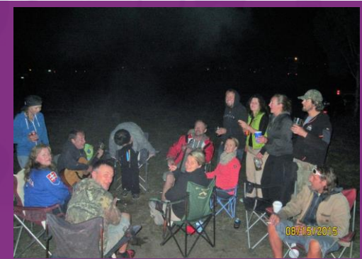
Czech and Slovak campings