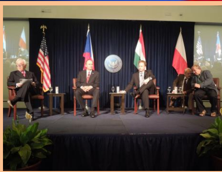
All panelists at Reagan Library