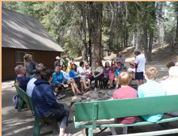
Sokol Family Camp attendees enjoyed many outdoor activities.