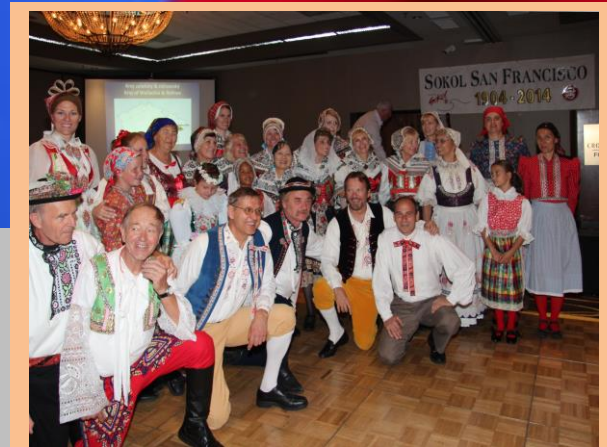
A bouquet of colors and smiles on the picture taken just after the Kroje show.