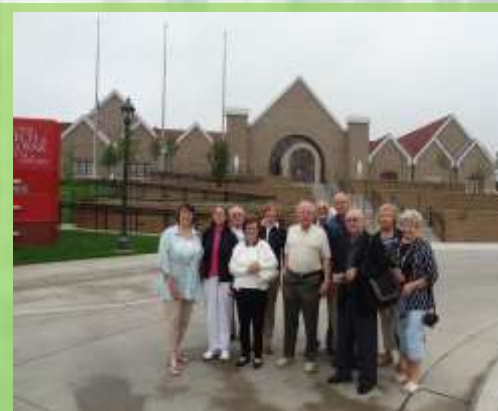
Participation at XV. Slet in Prague, 2012, and a trip to Czech and Slovak National Museum and Library in Cedar Rapids, Iowa, in 2013, were the most successful Sokol San Francisco actions within last couple of years.