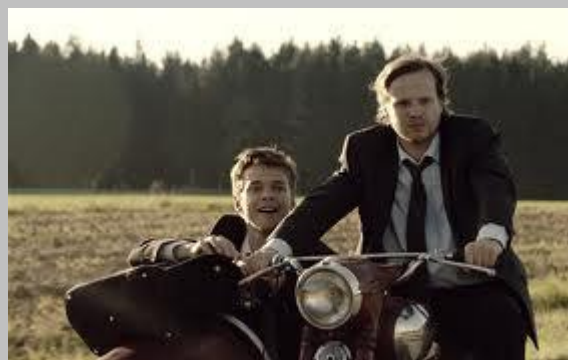
Vojta Dyk & Kryštof Hádek in the film „Signal“