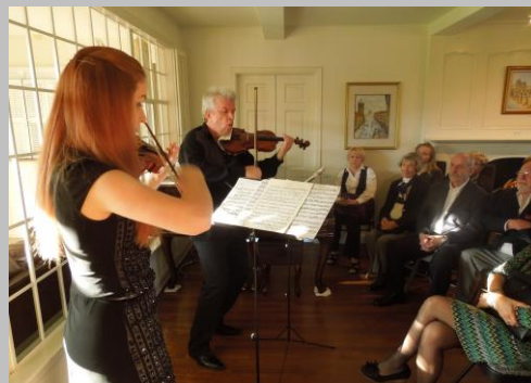
Jaroslav Svěcený and his daughter Julie