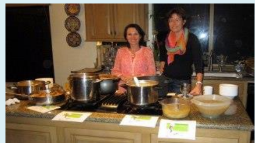
Traditional Czech cuisine event

On March 19th, 2013 the Czech School of California hosted its first Traditional Czech Cuisine event that was a unique opportunity to come together, network with the Czech community and enjoy fabulous entertainment by students of the School. Around 60 guests tasted over thirty delicious, traditional Czech foods – including soups, main courses, and a vast variety of desserts! The event was a great success and we are already much anticipating the second year of annual event of Traditional Czech Cuisine.